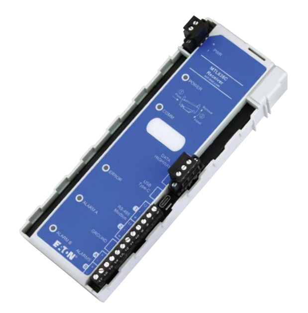
Figure 1.1 - MTL838C Receiver