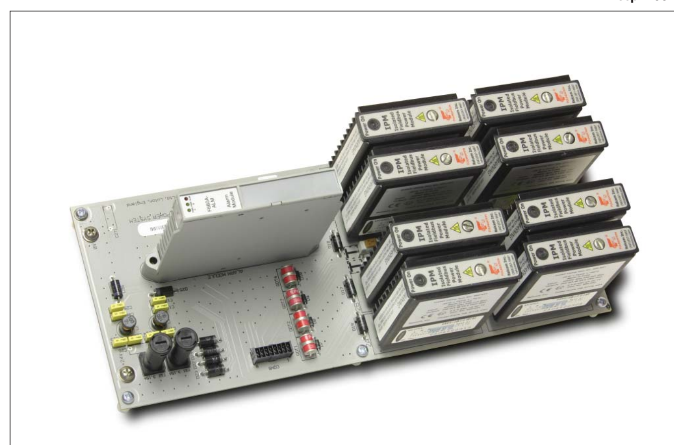
Figure 1: - Fully populated F660A IOTA