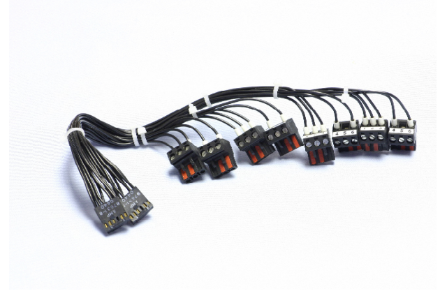
Cable assembly type FCAB-02

The given data is only intended as a product description and should not be regarded as a legal warranty of properties or guarantee. In the interest of further technical developments, we reserve the right to make design changes.