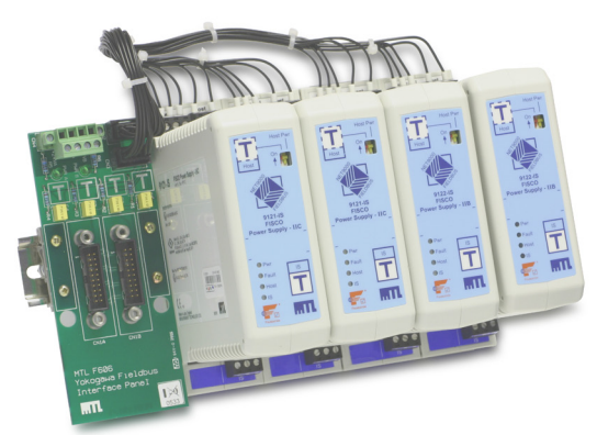
F606 used with NET9000 FISCO power supplies and FCAB-02 cable assembly